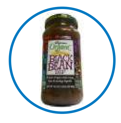
Wegmans Organic Black Bean Dip features a hint of spice with cumin, lime and smoky chipotle. The heart healthy product is suitable for vegans.