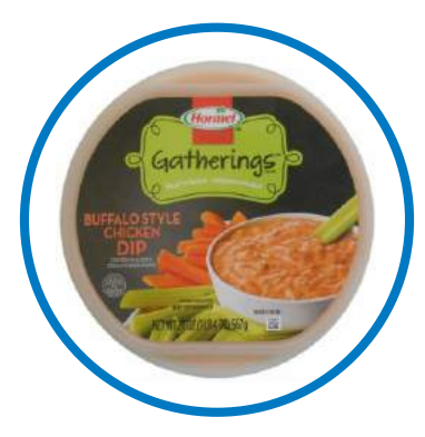
Dip is described as a spicy cream cheese sauce that is ready to heat and serve.