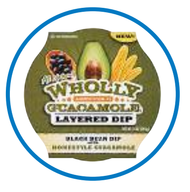
Wholly Guacamole Layered Dip is described as a taco bean dip over guacamole. This all natural dip contains no gluten and can be enjoyed cold or warm.