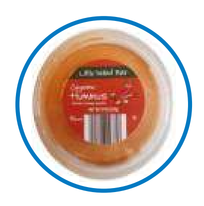
Little Salad Bar Cayenne Hummus is described as having a delicious and creamy texture.