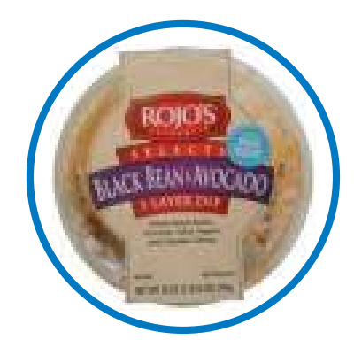
Rojo's Black Bean & Avocado 5 Layer Dip comprises whole black beans, avocado, salsa, yogurt and cheddar cheese. The gluten-free product is made with Greek yogurt.