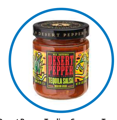
Desert Pepper Trading Company Tequila Salsa is a concoction of red tomato, fiery chiles and bright, silver tequila. The sauce is all natural and gluten free with medium burn.

Guacamole has been relaunched in a new 100-calorie mini cups format. The all natural dip with a homemade taste is handscooped, free from gluten and preservatives and is great for on-the-go.