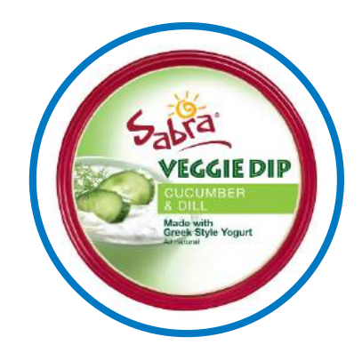
Sabra Cucumber Dill Tzatziki Greek Yogurt Dip is all natural and gluten free. This kosher certified product retails in a 10-oz. pack.

Dips have traditionally had an unhealthy reputation, especially if they have sour cream or cream cheese as a base. But today's dips are lightening up with all natural ingredients and alternative bases like hummus or Greek yogurt. Manufacturers have noticed the increase in consumers shopping "health" and are developing line extensions and new product lines centered around better-for-you ingredients and health claims. More than one quarter (27%) of those who purchase snacks do so because there are more healthy versions of these items available.