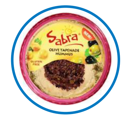
Sabra Olive Tapenade Hummus is free from gluten, trans fat and cholesterol.

The success of Sabra within the hummus market has analysts' calling it "the next Greek yogurt." And that's saying a lot because the Greek yogurt market certainly has had a meteoric rise in the snacking world. The sales decline for many dip brands from 2012-2013 can be attributed to consumers seeking upscale and healthy dip choices, like hummus for their snacking and party pleasure.