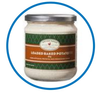
Archer Farms Loaded Baked Potato Dip is made with bacon, Monterey Jack cheese and sour cream. The premium product is suitable with potato chip nachos or French fries.

Consumers are craving dips that reflect their favorite meals. We like to call them "whole meal" flavors and anticipate these flavors to be bold and familiar. Expect for consumers to take to these flavors like their favorite buffalo chicken sandwich.