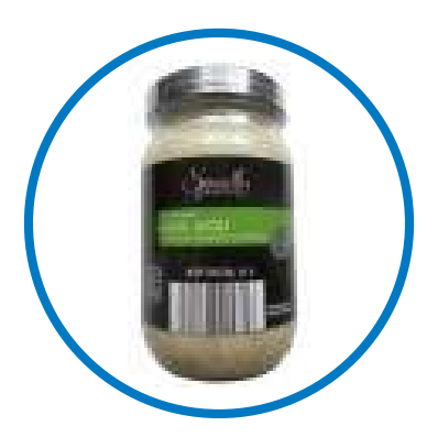
Specially Selected All Natural Basil Aioli Premium Sandwich Spread contains 90 calories per one tablespoon serving.

Dipping a chip into one dip flavor brings a smile; dipping into a layered flavored hummus or dip brings fireworks. Check out these flavor combos that are challenging our taste buds and taking the work out of preparing a layered dip recipe.