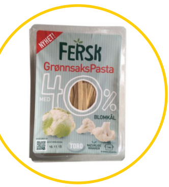
Cauliflower Pasta: Norway