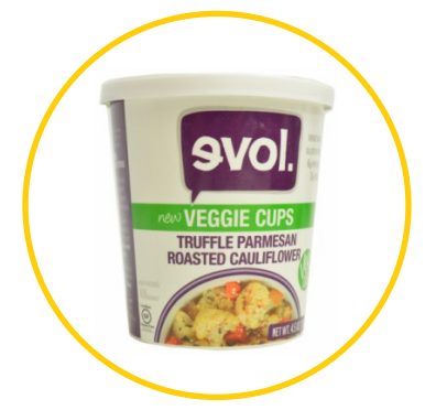
Truffle Parmesan Roasted Cauliflower Cup: US