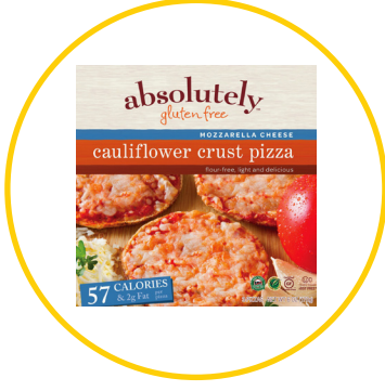
Cauliflower Crust Pizza: US