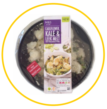
Cauliflower, Kale & Leek Melt: Ireland