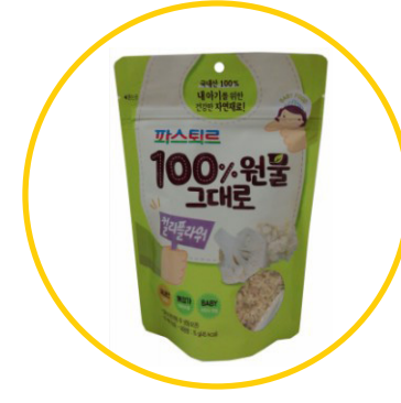
Freeze Dried Cauliflower: S. Korea