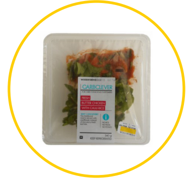
Fresh Butter Chicken with Cauli Rice: South Africa